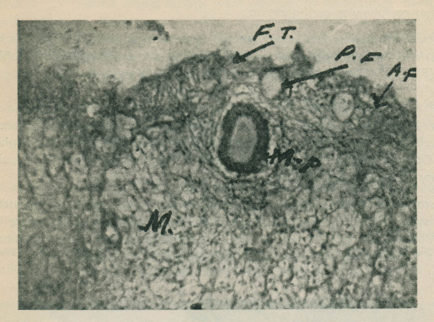
Fig. 3: Ovary showing metaplasia (430x)

T.S. of ovaries after 7th week : Size of ovary was markedly reduced. In some specimens granulosa cells showed columnar metaplasia (Fig. 3-M.P.).